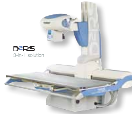
STATIF PRO DREAM Universal systems